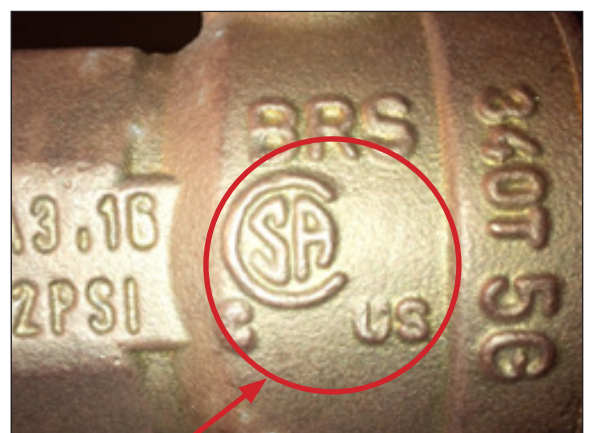
Proper, consistent CSA certification markings.

Learn more: www.csagroup.org/ca/en/about-csa-group/certification-marks-labels