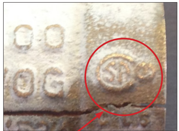
Look for improper, fraudulent CSA certification markings, or no CSA markings at all.