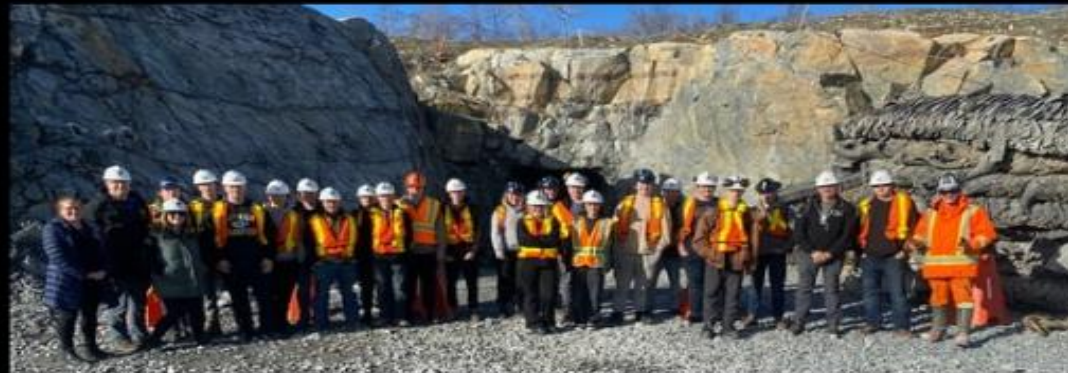
Lively Highschool Tour