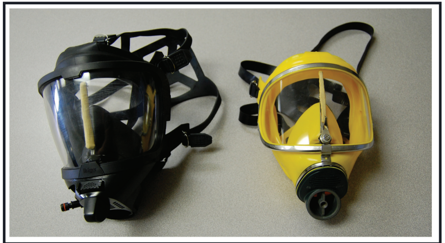
The new FPF 7000 (left), compared to the Panorama Nova facemask, has a larger field of vision, larger wiper handle, and of course, a straw for sipping.