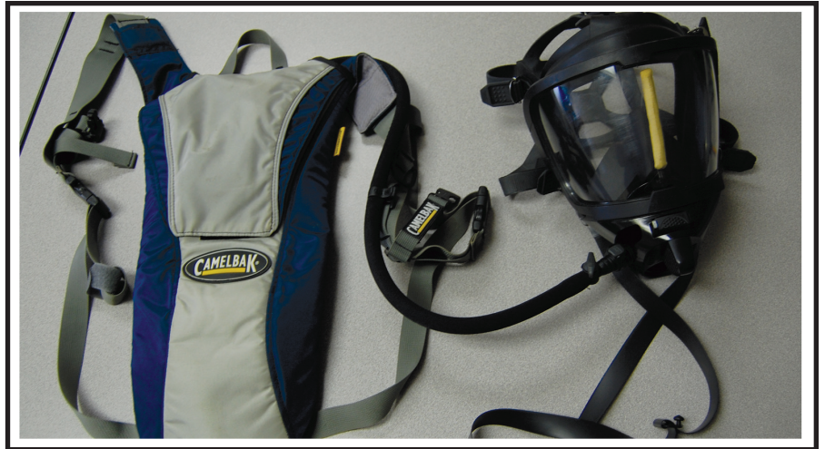
Go ahead have a sip. Drager Safety's new hydration facemask, the FPF 7000, connects to a two-litre CamelBak through a long flexible straw.