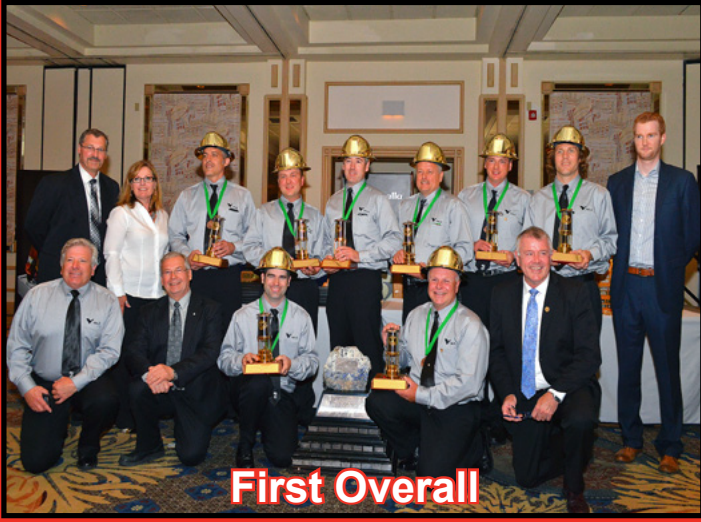
First Overall Vale West Mines