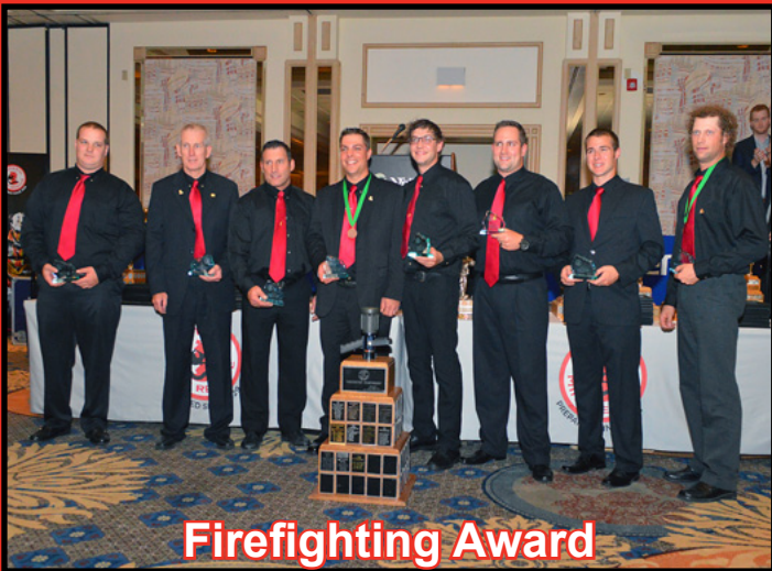
Firefighting Award AuRico Gold, Young-Davidson Mine