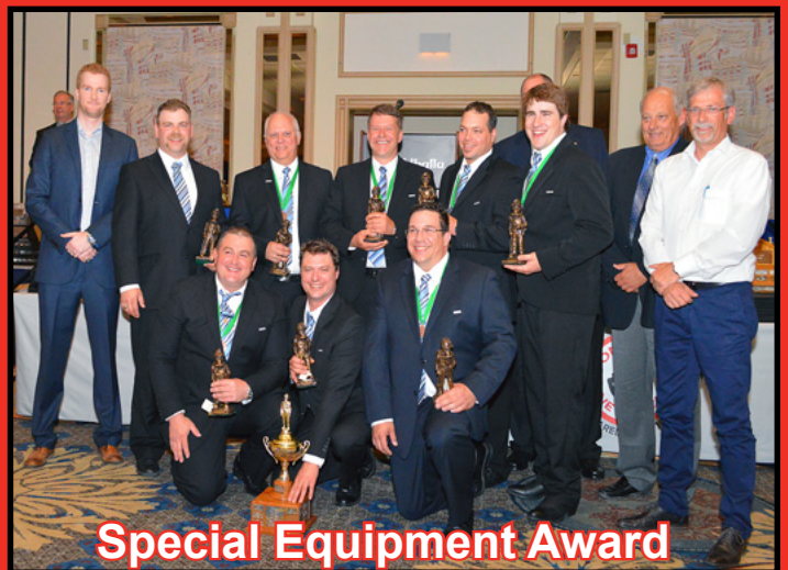
Special Equipment Award Dumas Contracting Ltd.