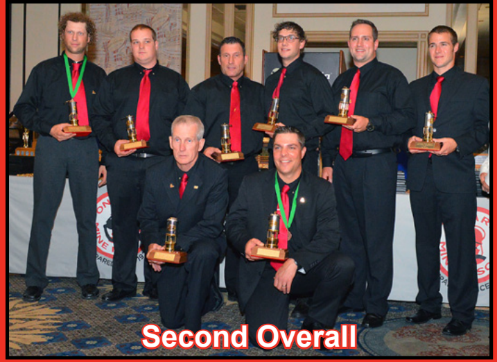
Second Overall AuRico Gold, Young-Davidson Mine