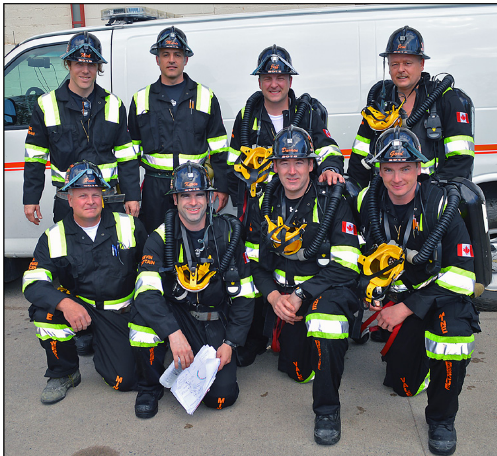
Vale West Mines rescue team poses following first day action at the 2015 Provincial Mine Rescue Competition at Fort Williams Gardens in Thunder Bay.