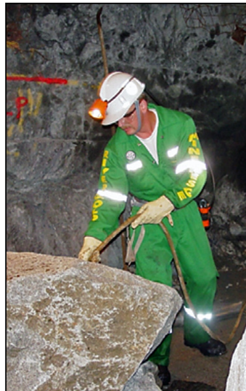
2004 – UNDERGROUND. Wesdome Eagle River Gold Mine’s team is among the first to compete underground at Fecunis.