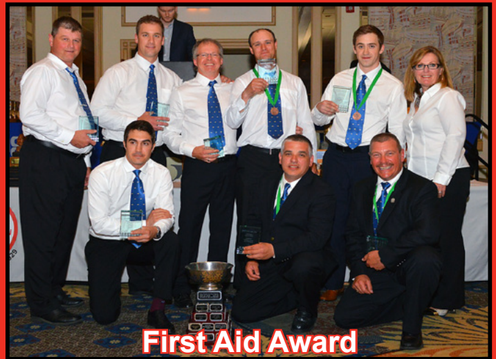
First Aid Award Barrick Hemlo