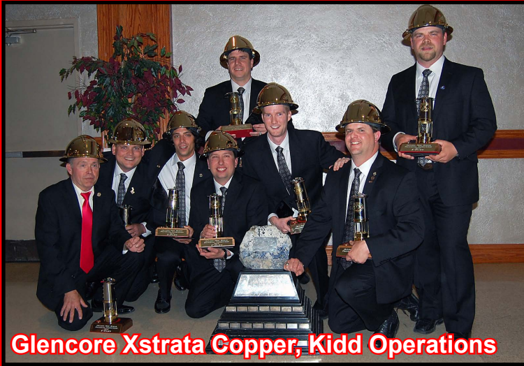
Glencore Xstrata Copper, Kidd Operations First Overall