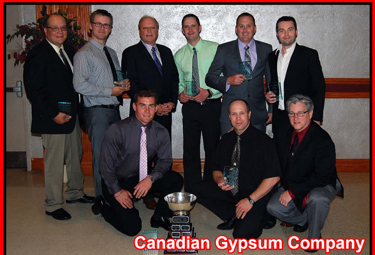
Canadian Gypsum Company First Aid Award