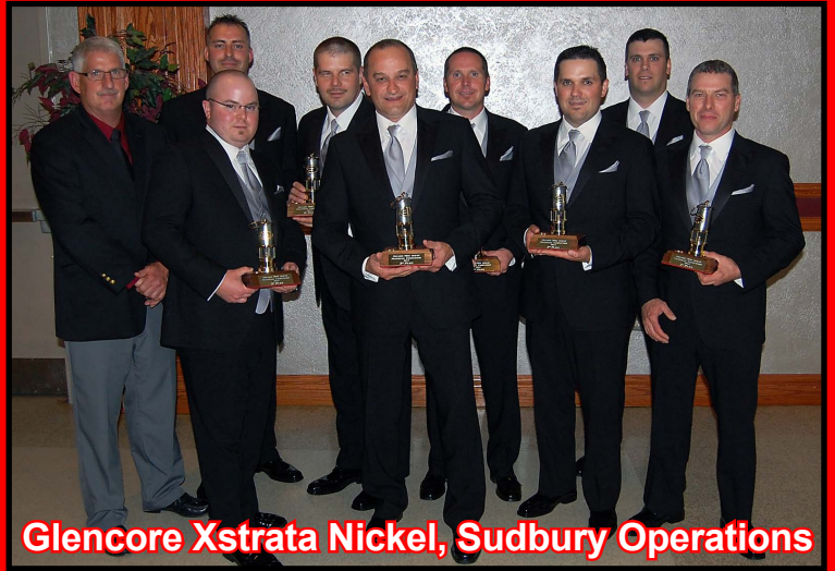
Glencore Xstrata Nickel, Sudbury Operations Second Overall