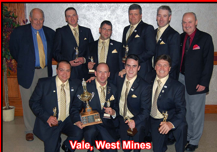
Vale, West Mines Special Equipment Award