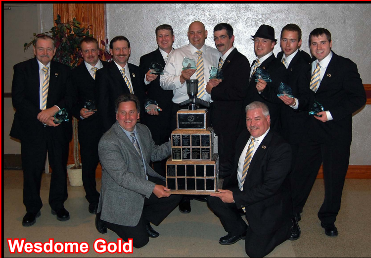
Wesdome Gold Firefighting Award